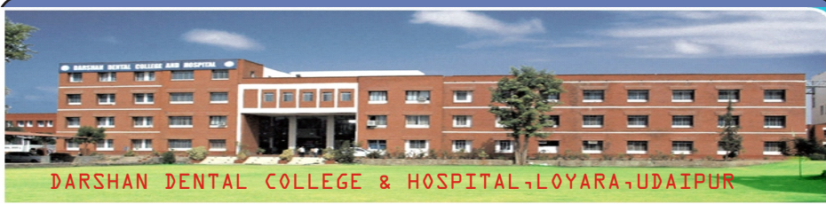
DARSHAN DENTAL COLLEGE & HOSPITAL, LOYARA, UDAIPUR